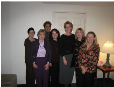
<ADHA Council Regulation and Practice