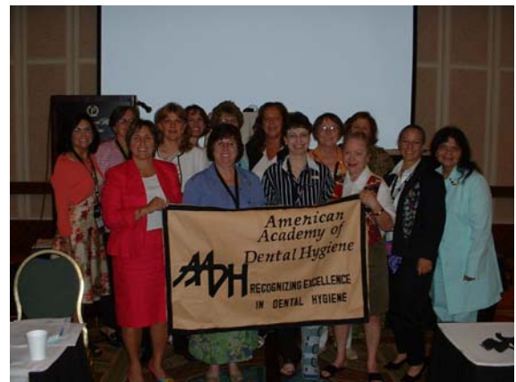
2005 AADH Annual Session at RDH Magazine's Under One Roof Meeting in Chicago